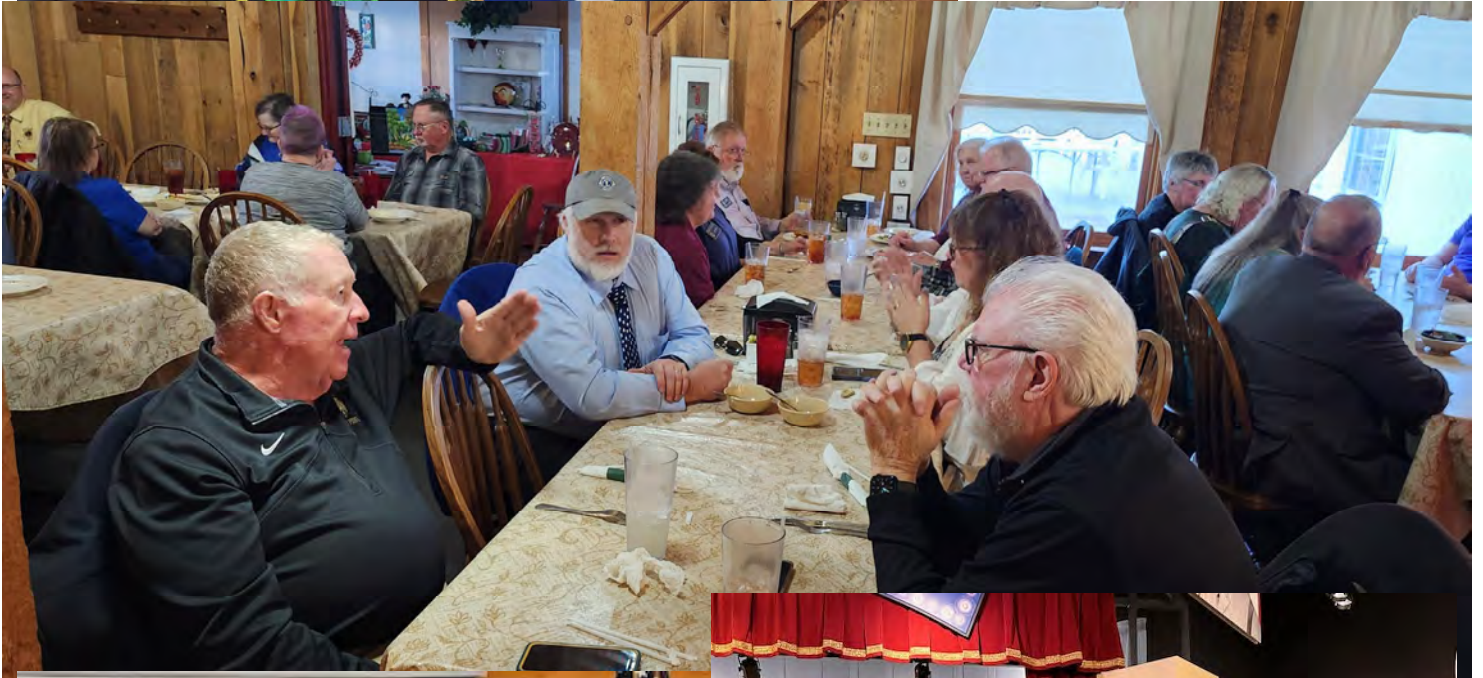
Below: part of the Friday night attendees at the convention. The food was great!